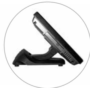
Low Profile Mode