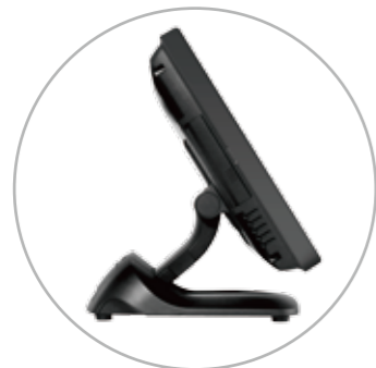
Full Extended Mode

The XT-8315 provide the selection of two foldable bases, the curvy slim GEN7E base and the larger but practical GEN8E base. The foldable base can be configured into "Flat Folded Mode" to save the shipping package volume, "Low Profile Mode" to allow greater interaction between the cashier and the customer, and the traditional "Full Extended Mode". All this can be achieved with a simple pull of the hidden lever.