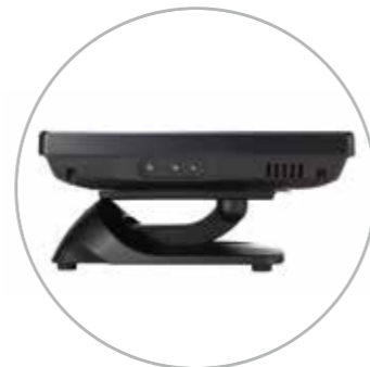
Flat Folded Mode